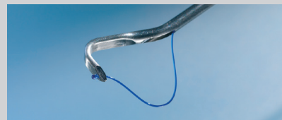
3) Pull the needle back, the suture remains in place

Once equipped with the disposable loading unit, which comprises the thumb-slider, a dispenser, a hollow needle and specially formed suture material, the reusable instrument is ready for suture fixation in just three simple steps. Once positioned, the tip of the i-Stitch is pressed into the tissue until it penetrates. The hollow needle filled with suture material is then pushed forward until the elastic suture end passes through the instrument's tip. Once the suture end has clicked firmly into place, the hollow needle can be pulled back and the instrument removed carefully from the tissue.